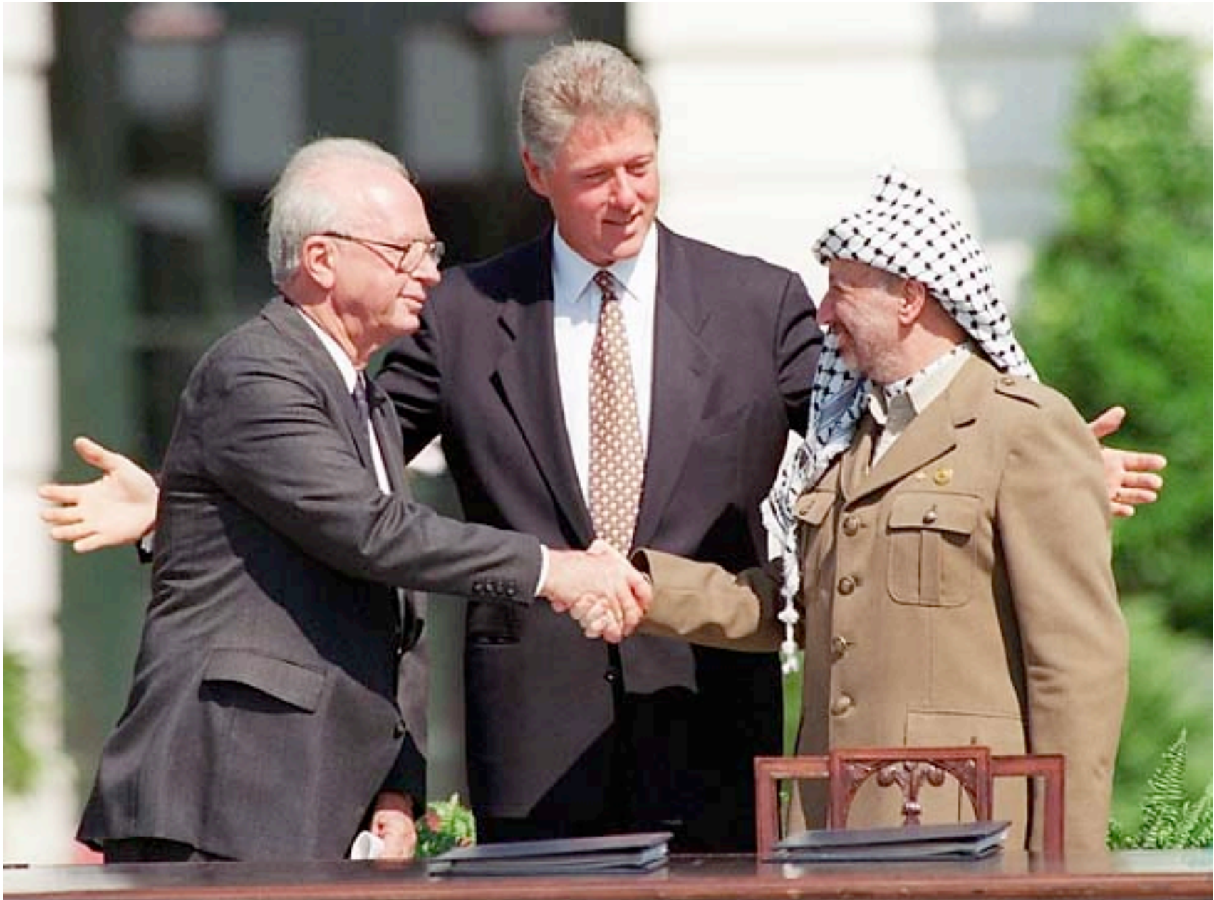
AP 1993 / Ron Edmonds