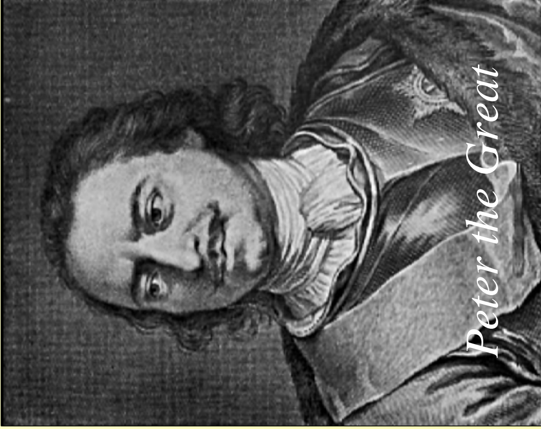
Peter the Great

“Do all in your power to approach closely Constantinople and India. Remember that he who rules over these countries is the real Sovereign of the World... Open for yourselves a route towards the Persian Gulf [IRAN]. Reestablish as much as possible, by means of Syria, the ancient commerce of Levant, and thus advance towards India. Once there, you will not require English gold.”